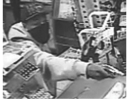
Security footage from the Briggs robbery